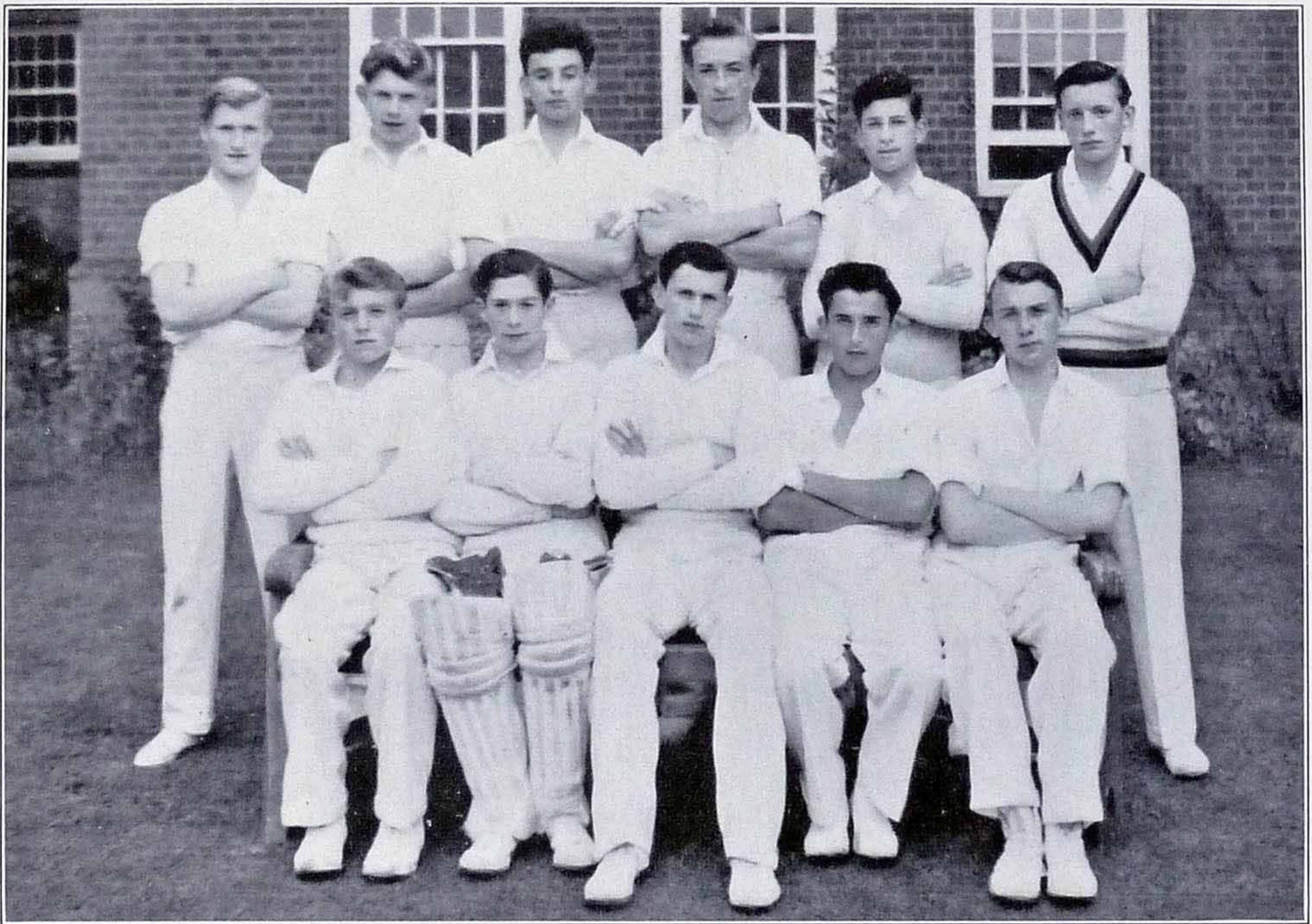
CRICKET 1ST XI., 1958